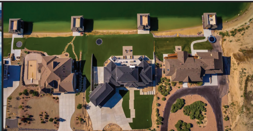
SIMILAR LAKE TO LAST CHANCE LAKES